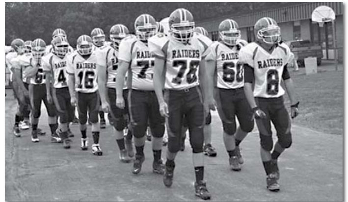
The Port Jervis - Middletown High School football rivalry is one of the oldest in the country. The Raiders have won 12 of the last 14 Erie Bell games.

"The importance of this game goes beyond the two teams playing that day. It is going to bring back great