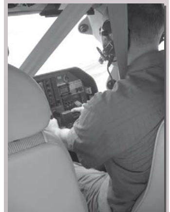
Learning how to fly a Cessna plane was one of the added bonuses offered to Space Academy participants by the Civil Air Patrol.

4 RAIDERS BRINGING BACK THANKSGIVING ERIE BELL GAME