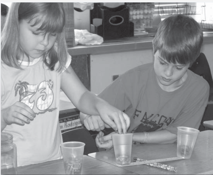
Hands-on projects such as this third grade science experiment engage elementary students in activities designed to provide them with the skills needed to meet the New York State learning standards.