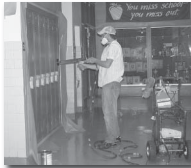
(Left) Port Jervis Middle School lockers receive a new bright coat of red paint. (Above) Construction crews have worked all summer to replace the roof and make other needed repairs at Hamilton Bicentennial Elementary School.