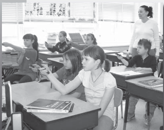
Interactive technology such as the Classroom Performance System gives every student in the classroom the opportunity to answer the teacher's questions electronically using a hand-held clicker.