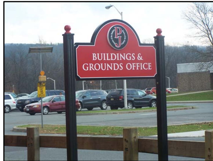
Building & Grounds