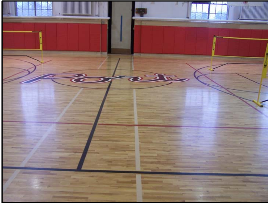
New Gym Floor