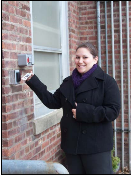
Security Keypad Entrance