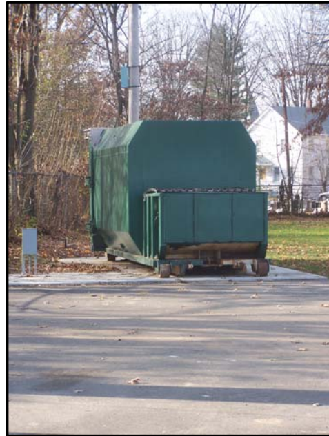
Trash Compactor On Glennette Field