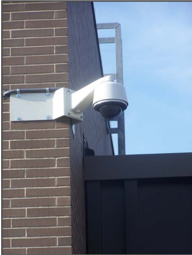
Security Cameras Inside & Outside Of the Building