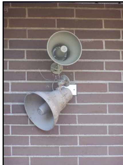
Speakers on the Outside of the Building are Being Replaced