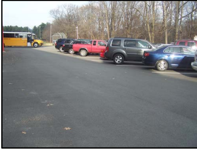
New Paved Parking Lot