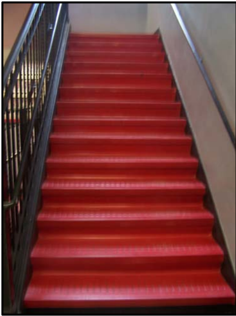
Stair Tread Replacements