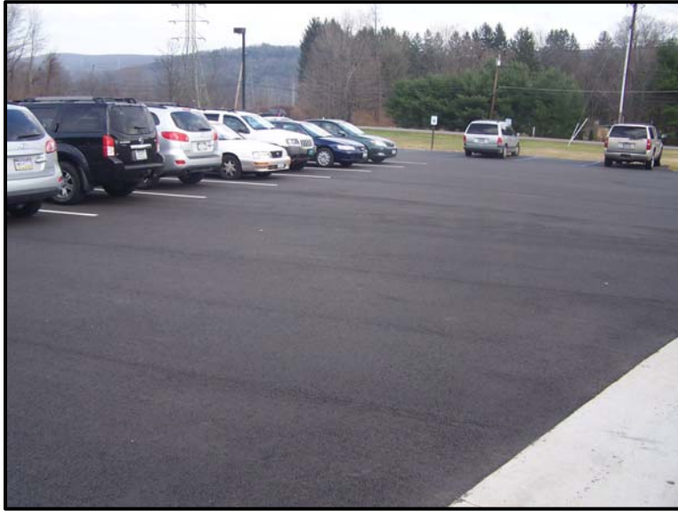
New Paved Parking Lot