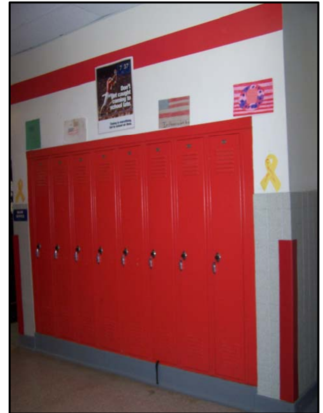
Refurbished Lockers & Wall Tiles