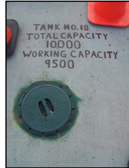
Oil Tanks were Replaced