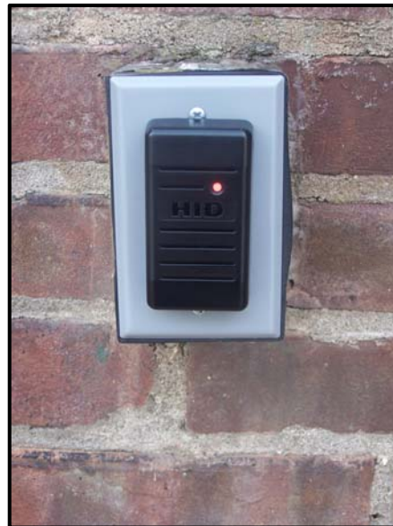
I.D. Badge Scanners For all Staff